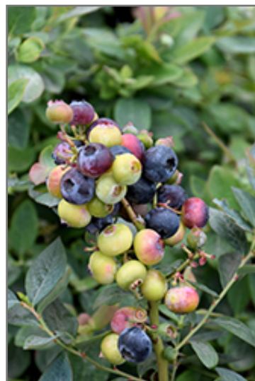
Pink Icing Blueberry fruit

This is a multi-stemmed deciduous shrub with an upright spreading habit of growth. Its relatively fine texture sets it apart from other landscape plants with less refined foliage. This is a relatively low maintenance plant, and usually looks its best without pruning, although it will tolerate pruning. It is a good choice for attracting birds to your yard. It has no significant negative characteristics.