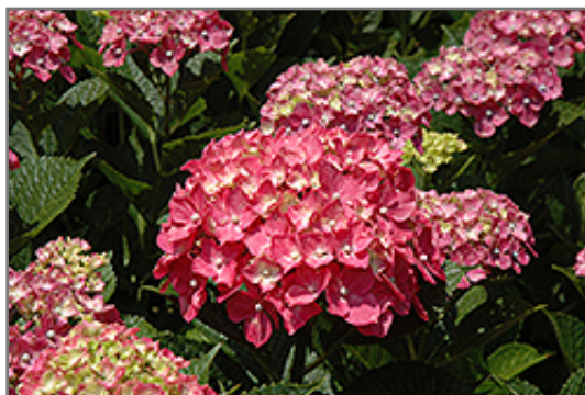
Forever Pink Hydrangea flowers

Forever Pink Hydrangea will grow to be about 3 feet tall at maturity, with a spread of 3 feet. It tends to be a little leggy, with a typical clearance of 1 foot from the ground. It grows at a fast rate, and under ideal conditions can be expected to live for approximately 20 years.