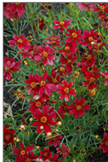
Red Satin Tickseed flowers