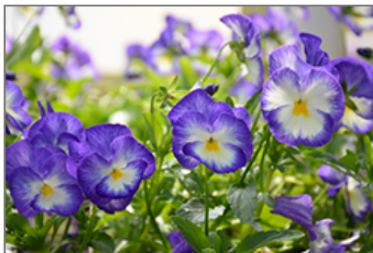
Halo Lilac Pansy flowers