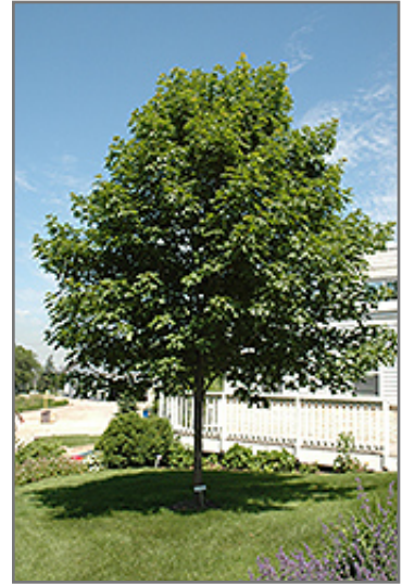
Fall Fiesta Sugar Maple

* This is a 'special order' plant - contact store for details