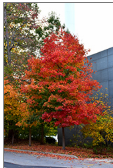
Fall Fiesta Sugar Maple in fall