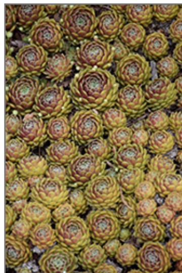
Piloseum Hens And Chicks

Piloseum Hens And Chicks is recommended for the following landscape applications;