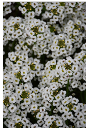
Stream White Sweet Alyssum flowers

Stream White Sweet Alyssum is recommended for the following landscape applications;