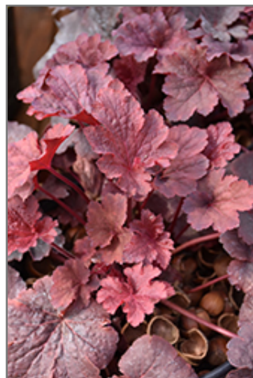
Cajun Fire Coral Bells foliage

Cajun Fire Coral Bells is recommended for the following landscape applications;