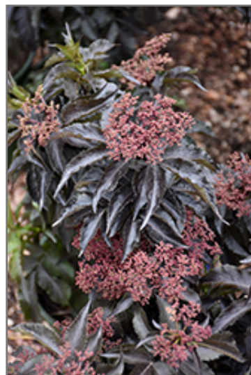
Black Tower Elder flower buds