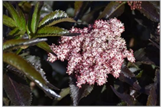
Black Tower Elder flowers

* This is a 'special order' plant - contact store for details