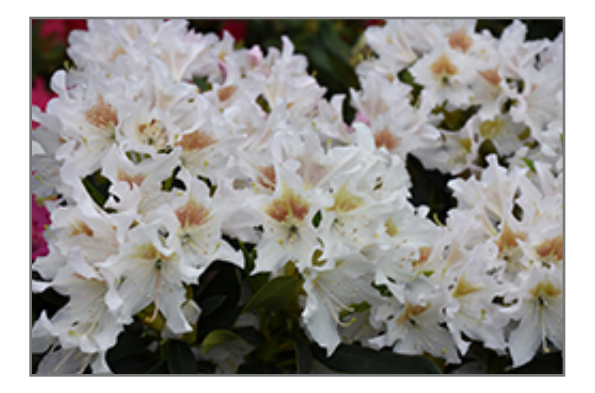
Cunningham's White Rhododendron flowers