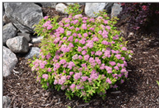
Dakota Goldcharm Spirea in bloom