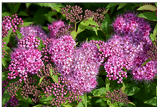
Anthony Waterer Spirea flowers