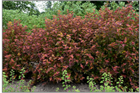
Amber Jubilee Ninebark

This shrub does best in full sun to partial shade. It is very adaptable to both dry and moist locations, and should do just fine under average home landscape conditions. It is not particular as to soil type or pH. It is highly tolerant of urban pollution and will even thrive in inner city environments. This is a selection of a native North American species.