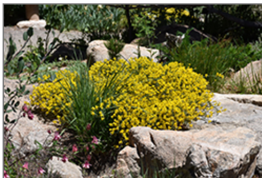
Vancouver Gold Woadwaxen in bloom