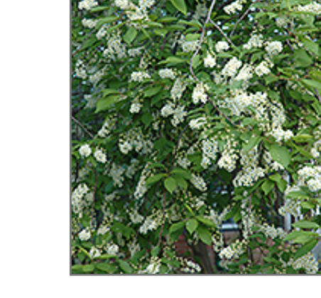
Schubert Chokecherry flowers

Schubert Chokecherry will grow to be about 25 feet tall at maturity, with a spread of 20 feet. It has a low canopy with a typical clearance of 4 feet from the ground, and is suitable for planting under power lines. It grows at a medium rate, and under ideal conditions can be expected to live for 40 years or more. This is a self-pollinating variety, so it doesn't require a second plant nearby to set fruit.