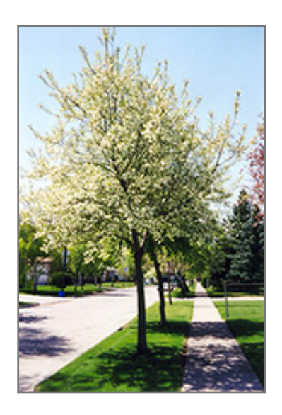
Schubert Chokecherry in bloom

Schubert Chokecherry is a deciduous tree with a more or less rounded form. Its average texture blends into the landscape, but can be balanced by one or two finer or coarser trees or shrubs for an effective composition.