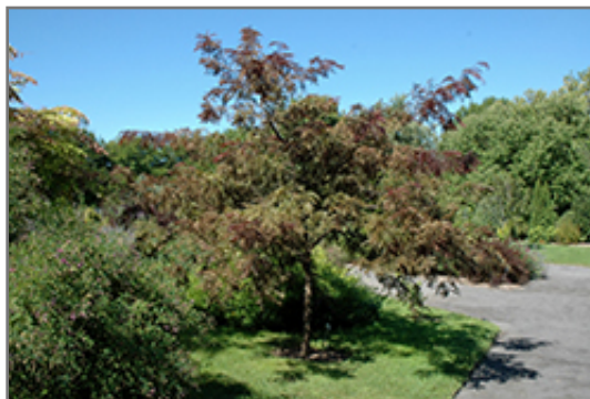
Ruby Lace Honeylocust