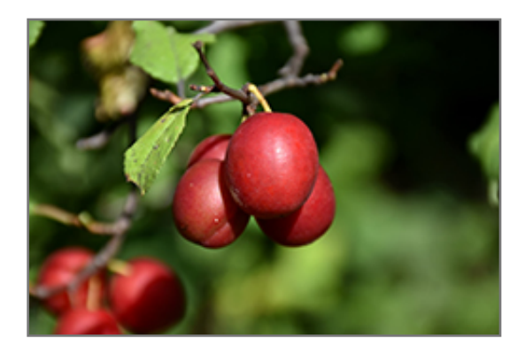
Toka Plum fruit