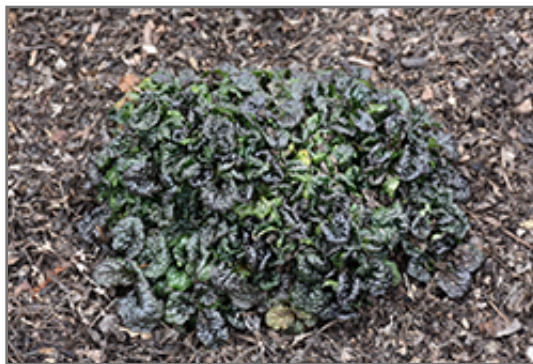
Mini Crisp Red Bugleweed