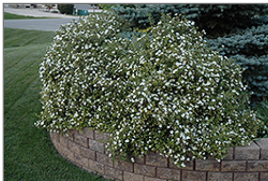
Abbotswood Potentilla in bloom