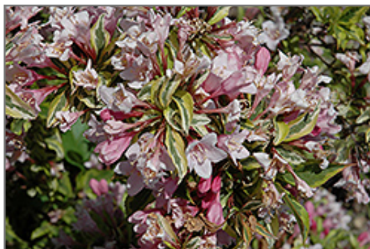
Rainbow Sensation Weigela flowers

Rainbow Sensation Weigela is recommended for the following landscape applications;