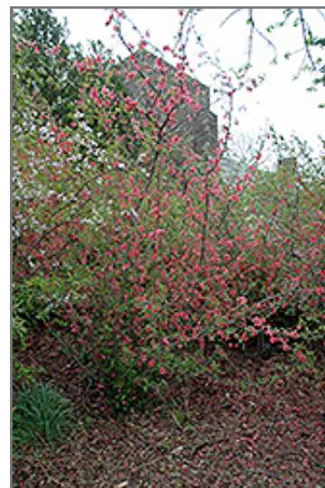
Pink Lady Flowering Quince in bloom