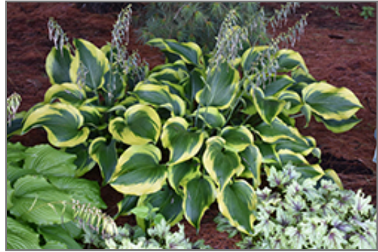
Atlantis Hosta

Atlantis Hosta is recommended for the following landscape applications;