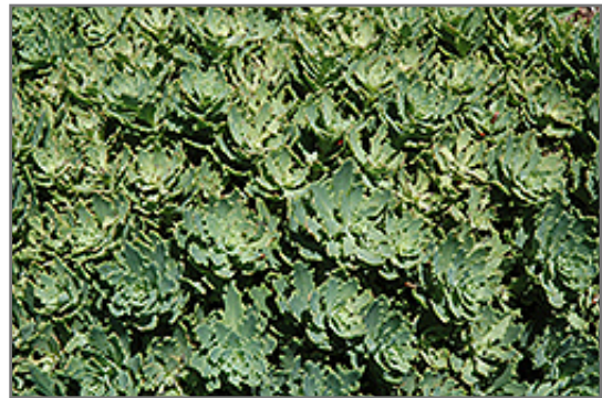
Thundercloud Stonecrop