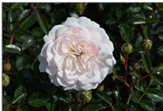
Sea Foam Rose flowers