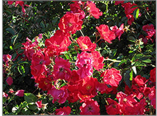
Flower Carpet Red Rose flowers

* This is a 'special order' plant - contact store for details