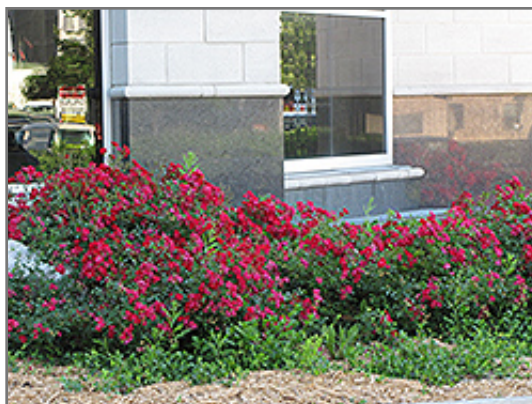
Flower Carpet Red Rose in bloom