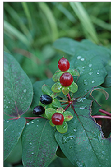
Albury Purple St. John's Wort fruit

Albury Purple St. John's Wort makes a fine choice for the outdoor landscape, but it is also well-suited for use in outdoor pots and containers. With its upright habit of growth, it is best suited for use as a 'thriller' in the 'spiller-thriller-filler' container combination; plant it near the center of the pot, surrounded by smaller plants and those that spill over the edges. It is even sizeable enough that it can be grown alone in a suitable container. Note that when grown in a container, it may not perform exactly as indicated on the tag - this is to be expected. Also note that when growing plants in outdoor containers and baskets, they may require more frequent waterings than they would in the yard or garden.