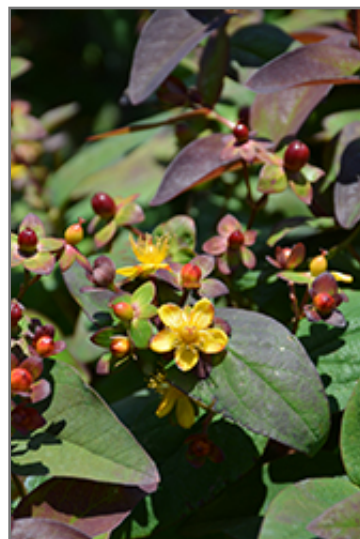
Albury Purple St. John's Wort flowers