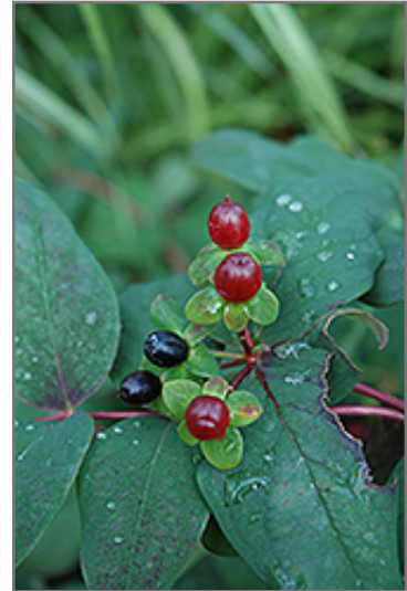
Albury Purple St. John's Wort fruit

* This is a 'special order' plant - contact store for details