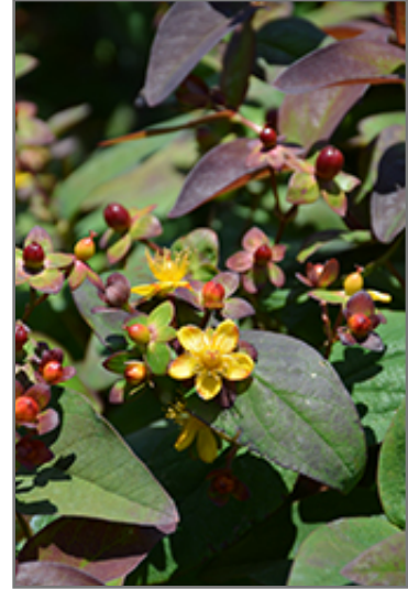
Albury Purple St. John's Wort flowers