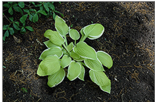
St. Elmo's Fire Hosta