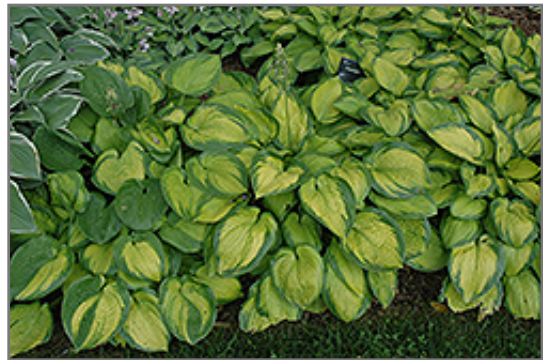
Paradigm Hosta