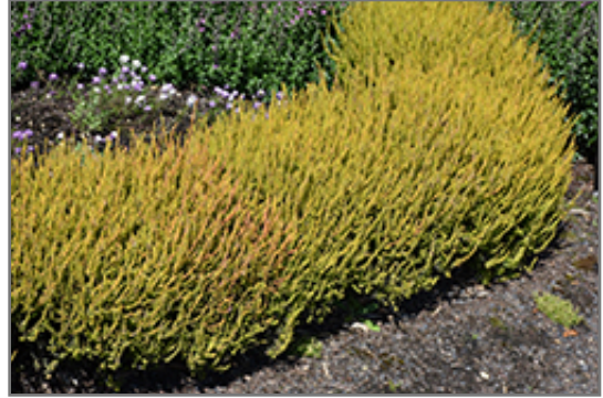
Firefly Heather

This shrub should only be grown in full sunlight. It requires an evenly moist well-drained soil for optimal growth, but will die in standing water. It is very fussy about its soil conditions and must have sandy, acidic soils to ensure success, and is subject to chlorosis (yellowing) of the foliage in alkaline soils. It is somewhat tolerant of urban pollution, and will benefit from being planted in a relatively sheltered location. Consider applying a thick mulch around the root zone in winter to protect it in exposed locations or colder microclimates. This is a selected variety of a species not originally from North America.