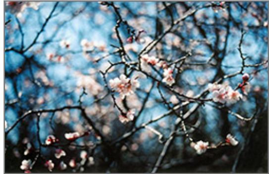
M604 Apricot flowers

M604 Apricot is blanketed in stunning clusters of fragrant shell pink flowers along the branches in early spring, which emerge from distinctive pink flower buds before the leaves. It has green deciduous foliage. The pointy leaves turn yellow in fall. The fruits are showy yellow drupes with gold overtones, which are carried in abundance in late summer. The fruit can be messy if allowed to drop on the lawn or walkways, and may require occasional clean-up.