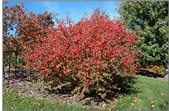
Korean Sun Pear in fall

Korean Sun Pear will grow to be about 15 feet tall at maturity, with a spread of 20 feet. It has a low canopy with a typical clearance of 2 feet from the ground, and is suitable for planting under power lines. It grows at a medium rate, and under ideal conditions can be expected to live for 50 years or more.