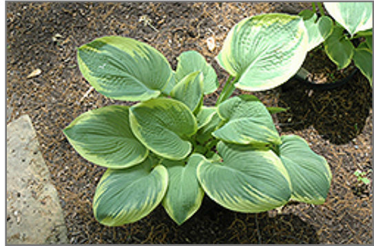
Robert Frost Hosta