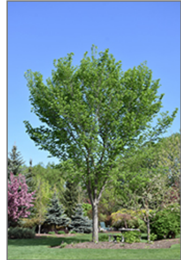
Brandon Elm