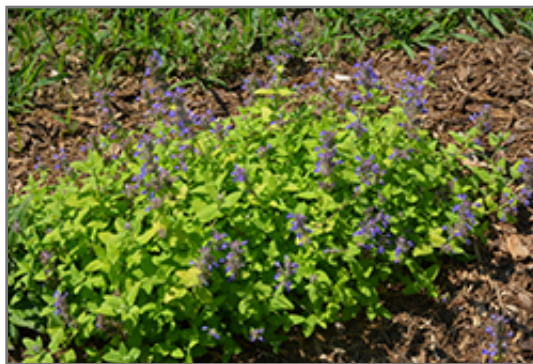
Chartreuse On The Loose Catmint in bloom