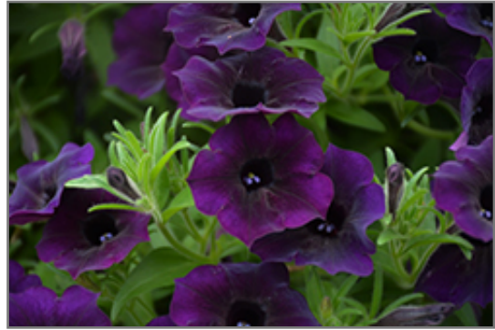
Supertunia Mini Vista Midnight Petunia flowers

This plant will require occasional maintenance and upkeep. Trim off the flower heads after they fade and die to encourage more blooms late into the season. It is a good choice for attracting butterflies and hummingbirds to your yard, but is not particularly attractive to deer who tend to leave it alone in favor of tastier treats. It has no significant negative characteristics.