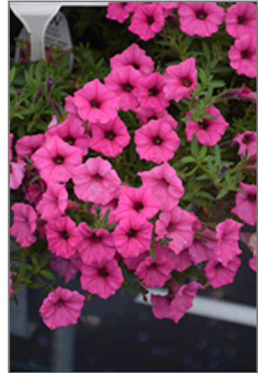
Supertunia Mini Vista Hot Pink Petunia flowers

Supertunia Mini Vista Hot Pink Petunia is recommended for the following landscape applications;