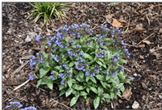
Pink-A-Blue Lungwort in bloom