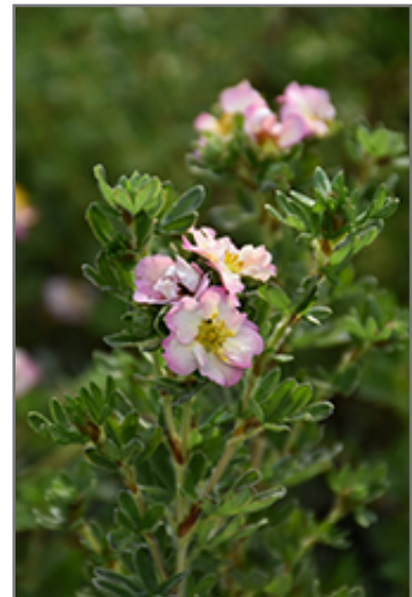
Happy Face Hearts Potentilla flowers