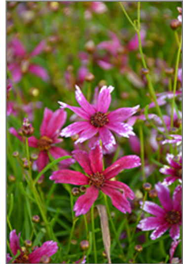
Satin & Lace Razzle Dazzle Tickseed flowers

Satin & Lace Razzle Dazzle Tickseed is recommended for the following landscape applications;