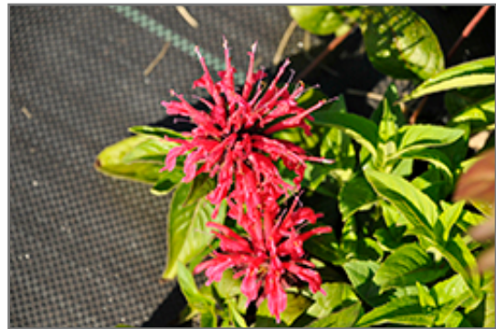
BeeMine Red Beebalm flowers