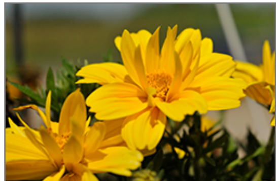
Sun Drop Double Yellow Bidens flowers