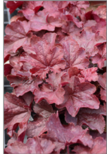
Northern Exposure Red Coral Bells foliage

Northern Exposure Red Coral Bells is recommended for the following landscape applications;