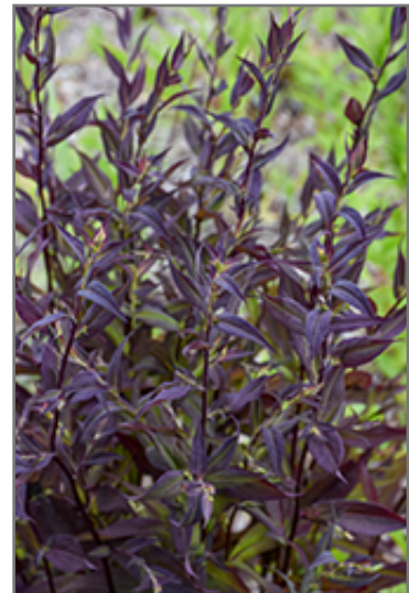
Lady In Black Calico Aster