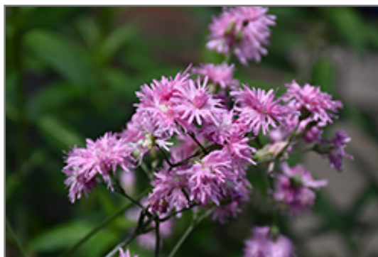
Petite Jenny Ragged Robin Campion flowers

Petite Jenny Ragged Robin Campion is recommended for the following landscape applications;