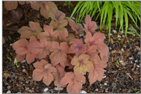
Pumpkin Spice Foamy Bells