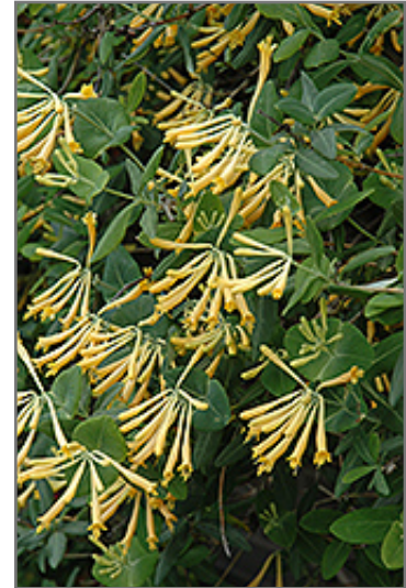
John Clayton Trumpet Honeysuckle flowers