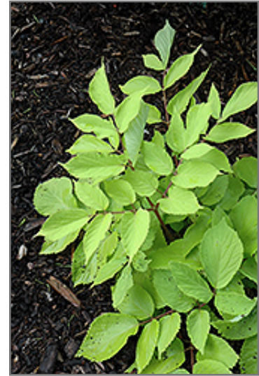
Sun King Japanese Spikenard foliage

This plant performs well in both full sun and full shade. It prefers to grow in average to moist conditions, and shouldn't be allowed to dry out. It is not particular as to soil type or pH. It is highly tolerant of urban pollution and will even thrive in inner city environments. This is a selected variety of a species not originally from North America.