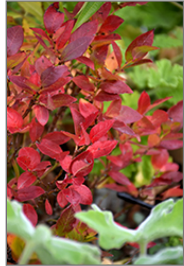
Jelly Bean Blueberry in fall

Jelly Bean Blueberry features dainty clusters of white bell-shaped flowers with shell pink overtones hanging below the branches in mid spring. It has red-variegated green foliage. The glossy oval leaves turn an outstanding red in the fall. It features an abundance of magnificent blue berries in mid summer.