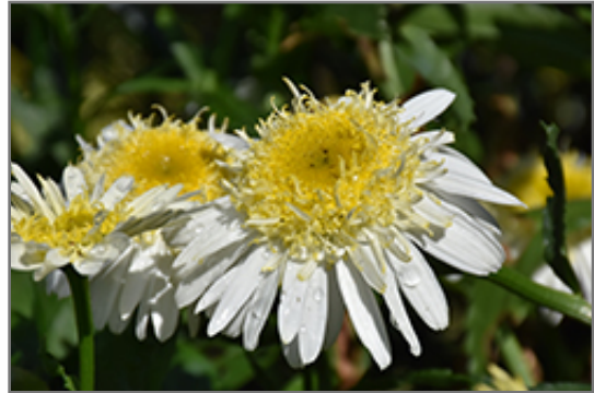
Realflor Real Glory Shasta Daisy flowers

Realflor Real Glory Shasta Daisy is recommended for the following landscape applications;