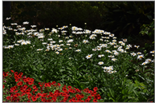
Brightside Shasta Daisy in bloom